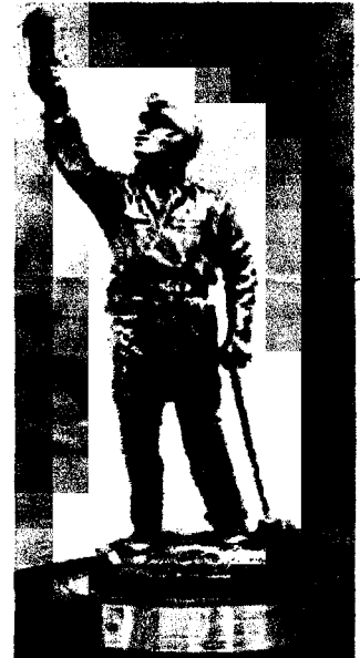
Pre-Shift Trophy 2002

A new pre-shift examiner contest was held during both mine rescue contests this year. A first for West Virginia, the contest was deemed a huge success. After mine rescue contests finished, the fields were again set up as a different working section. Then contestants were given 30 minutes to make a complete pre-shift exam as judges observed their procedures. We experienced a few moments when we were wondering if things were going to work out, however all went well with both contests. Although a similar contest is normally held in other states, many of the participants agreed our contest was well run and stood out as something really exciting.