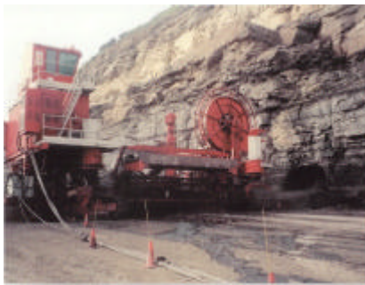
West Virginia Highwall Miner

The second film concerns one of the newest surface mining techniques – Highwall Miners. There are approximately 15 of these machines now operational in the state with more installations planned. A Highwall Miner is a hybrid cross of an auger and a continuous miner. Using a continuous miner head, coal recovery is much greater than with a conventional auger and the depth of the cut may be as deep as 900 feet. This video shows a Highwall Miner in operation and details the safety hazards associated with these machines.